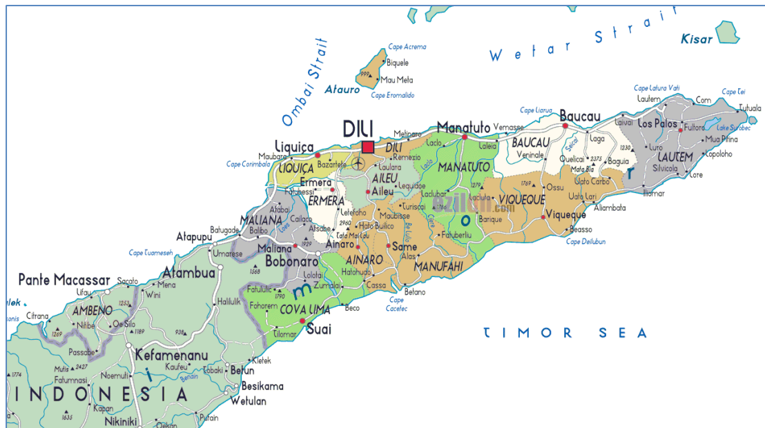
Figure 3 Map of Timor-Leste

Given the population size (some 100 farmers), MDF opted for a sample size of 30 farmers for the following reasons: